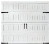
Long Panel Bead Board