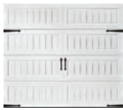
Long Panel Bead Board